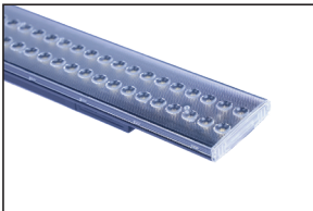
TS-line normal version